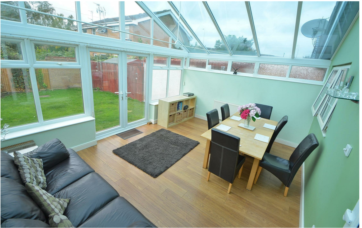
A TWO BEDROOM DETACHED BUNGALOW WITH A SOUTH-WEST FACING GARDEN, CONSERVATORY AND GARAGE.

Robert Ellis are extremely pleased to bring to the market this spacious two bedroom detached bungalow in a sought after location. The property has been extremely well maintained by the current owner and provides living space at the rear of the property with a conservatory off the kitchen. The kitchen has been upgraded in recent years and includes extensive ranges of wall and base units. To the front of the property it offers lots of space for off street parking and a viewing is a must to fully appreciate what the bungalow has to offer.